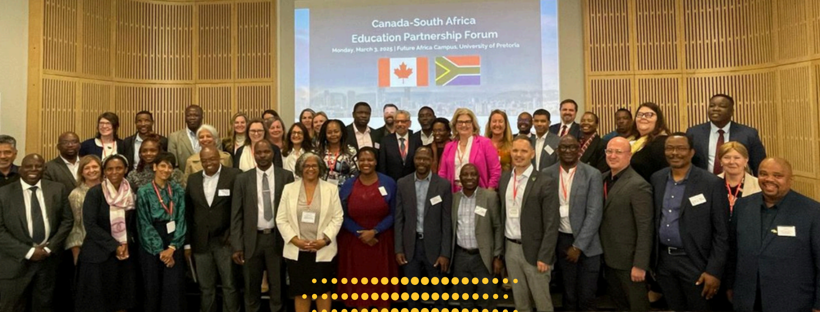
Participants at the Pretoria Forum